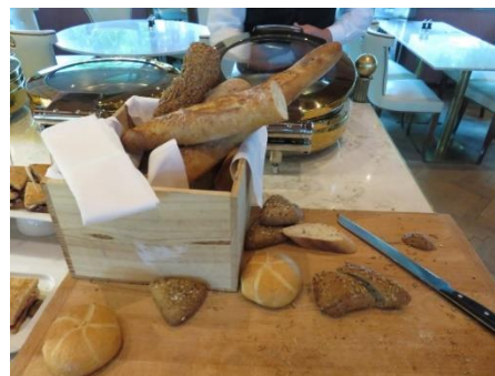
Wonderful French bread!!