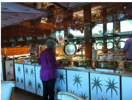
Breakfast and lunch were buffets

Food has been excellent aboard the ship with much too much to eat – French pastries, French bread. Wine for every meal, if you wish, open bar essentially. Entertainment has been excellent. On Friday night, we had a singer who had the place rocking. The night before there was a sax/keyboard duo. The first 2 nights we missed as we faded quickly after dinner.